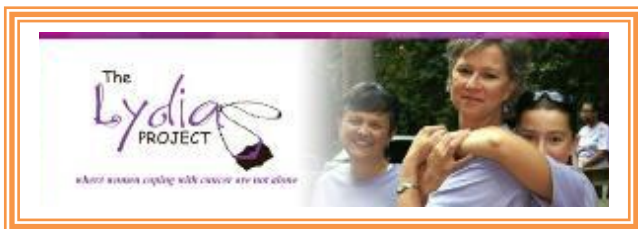
The Lydia Project, Augusta