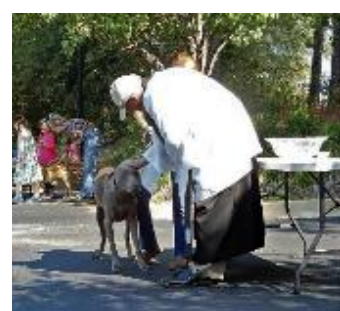
Teaching Weekend October 26-28