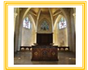
Christ Church, Jerusalem