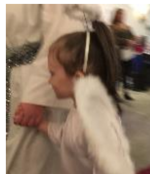
Children's Christmas Eve Service