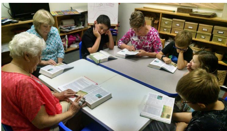
Sharing the Faith with the next generation

Holy Trinity A Beacon drawing people to God and into the fellowship of God's People.