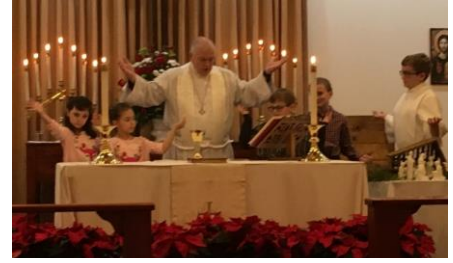
The children learning about Holy Eucharist as they celebrate at the altar