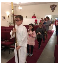
Jesus's birthday parade to place the figurines in the crèche